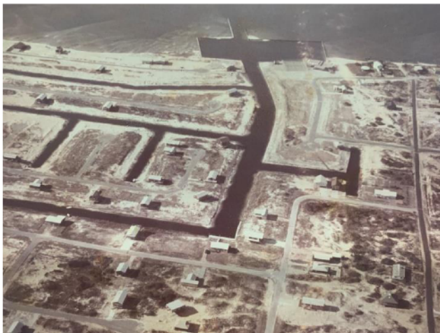
Aerial View 1970's

Hope to see everyone at the Memorial Day Picnic, May 28 th .