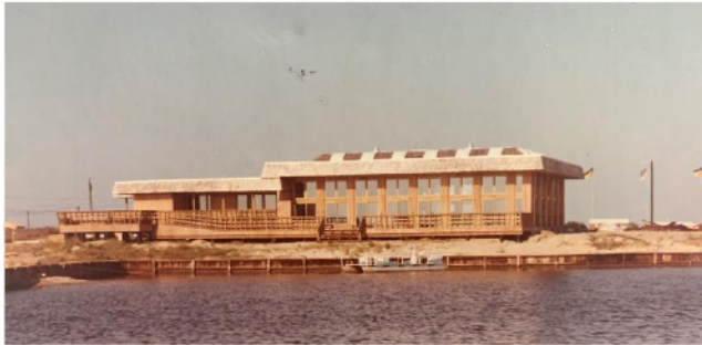
Clubhouse before lost to fire in 1980

Throughout the winter months we went through the office and did some winter cleaning. During this process I found some old photos I am hoping at some point to put together something to display in the clubhouse.