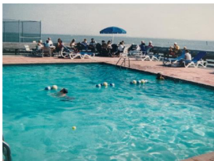
Clubhouse Annual Meeting 2002

This year we are going to try adult swim. We will start with Thursday, Friday, and Saturdays from 10AM to 11AM if this is successful, we will offer it Monday through Saturday. This will be for adults only. We are also going to keep the pool open past Labor Day for select hours as long as the water is not too cold. The pool will be open daily 11AM till 7PM from May 28 th through September 5 th weather permitting. Please make sure you have paid your $180.00 assessment as well as the $50.00 pool fee by May 28 th or your guest will be turned away. The $50.00 fee will allow the homeowners, their children under 18 and their grandchildren. Anyone else who wishes to use the pool will have to pay the $3.00 guest fee. The extended family Pool fee does not work for renters it is only for family members.